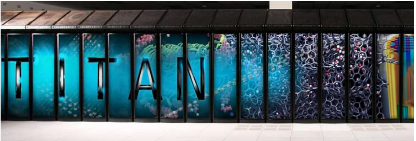
Titan supercomputer at the Oak Ridge National Laboratory.